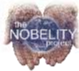
The Nobility Project